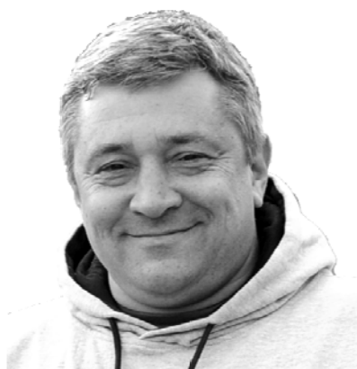
CLERK OF THE COURSE