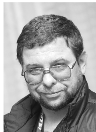
CHIEF SCRUTINEER - SERVICE PARK OFFICER